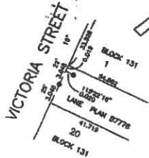
DETAIL NO SCALE